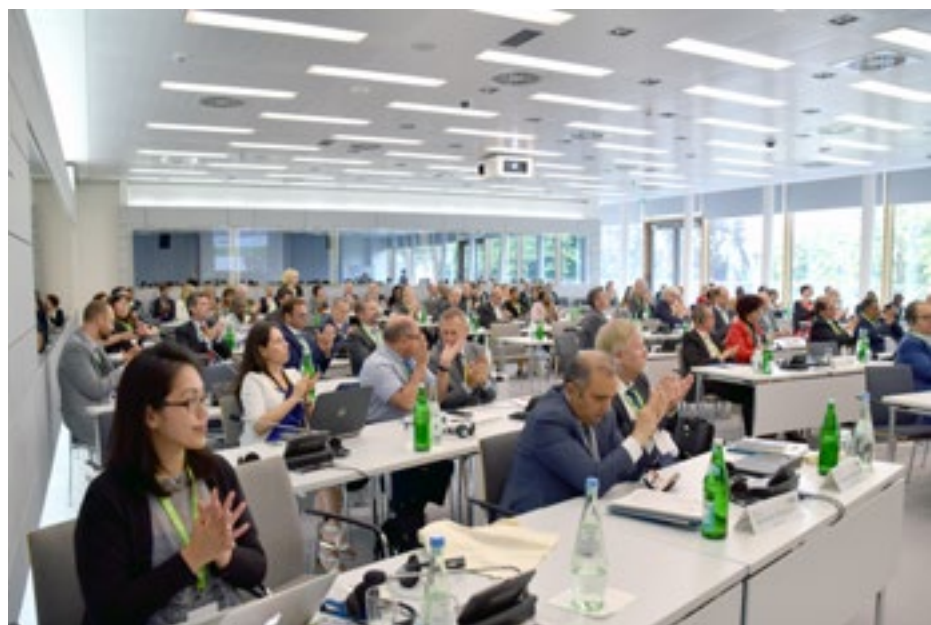
Participants at World Youth Skills Day 2016 in Bonn, Germany

The highly engaging programme included a panel discussion where representatives from Germany, Nigeria, Costa Rica, Morocco and Serbia presented on innovative practices undertaken by their respective countries to transform their TVET systems to contribute to sustainable development. A second panel discussion convened youth representatives from WorldSkills International, Skills in Action and Net-Med, as well as the European Centre for the Development of Vocational Training (Cedefop) and national actors from Germany and Canada to discuss ways to