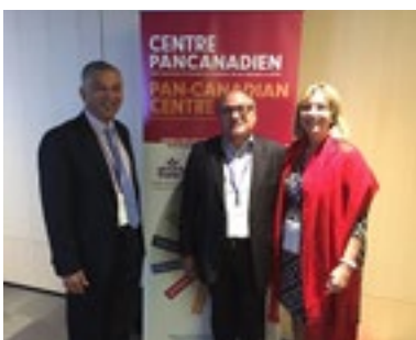
Meeting at the Annual Conference of Colleges and Institutes Canada

NCVER and UNESCO-UNEVOC, together with the Korean Research Institute for Vocational Education and Training (KRIVET), organized a conception meeting in Adelaide to discuss with selected UNEVOC Centres in Asia a collaborative research project to identify and highlight key issues in the measurement of the return on investment in TVET. Funding and financing are very important issues and understanding how stakeholders – from individuals, to enterprises, through to economies and societies – benefit is essential to understand better TVET systems and policies.