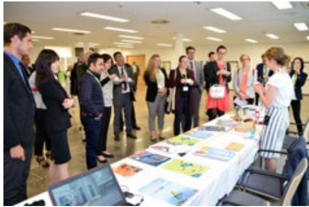
Participants take part in a skills demonstration at World Youth Skills Day 2016 in Bonn, Germany