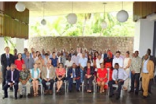
Participants at the regional meeting in the Seychelles

O n 16 to 18 March 2016, over fifty TVET stakeholders discussed and shared promising practices during a regional forum organized by the UNESCO Regional Office for Eastern Africa, in partnership with the UNESCO-UNEVOC, the Seychelles National Commission for UNESCO and the Ministry of Education of Seychelles.